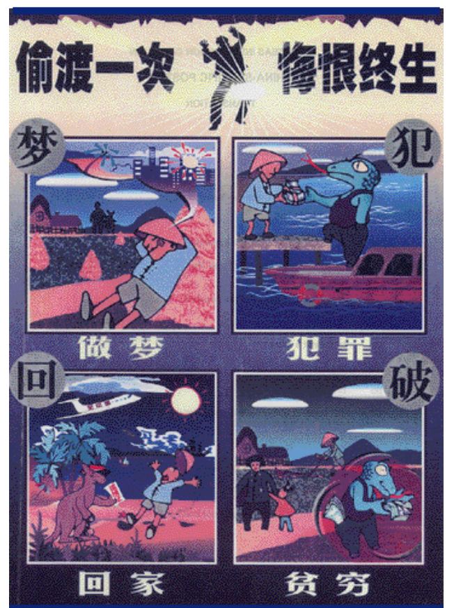
This poster, aimed at potential "unauthorized migrants" from China, depicts the futility of paying money to "snakeheads" (smugglers). The poster is part of Australia's overseas information campaign.

In response to critics who claimed the video component utilized "shock tactics," Ruddock said, "You might think they are a little sensational... [But] the information in all these videos is based on fact. These are very powerful weapons against a criminal