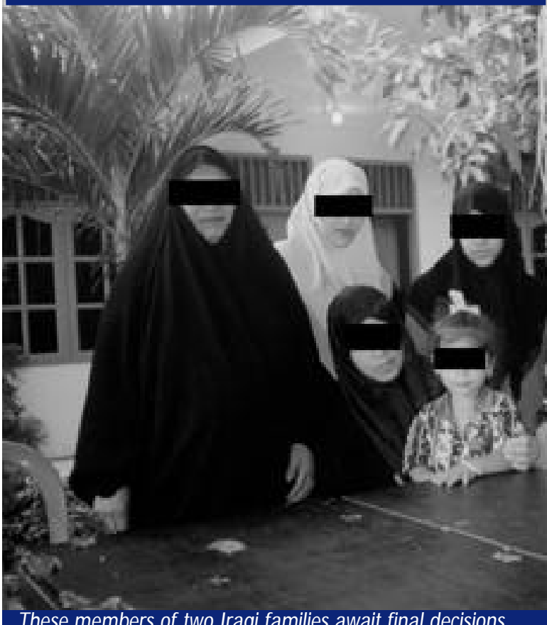
These members of two Iraqi families await final decisions from UNHCR on their refugee claims. In the meantime, they and about 120 other Iraqi asylum seekers reside in a hotel in Bogor, near Jakarta. "Saddam will kill us if we go back to Iraq," said one man. "If the UN says we're not refugees, where can we go?"

Australia's role in these arrangements comes primarily in the form of funding. The Australian government pays for all of the following: IOM expenses for accommodation, food, and other assistance to thirdcountry nationals who are "detained" (i.e., those not yet approved as refugees by UNHCR); IOM's costs for the voluntary removal of those who choose to depart Indonesia; and UNHCR's costs associated with refu-