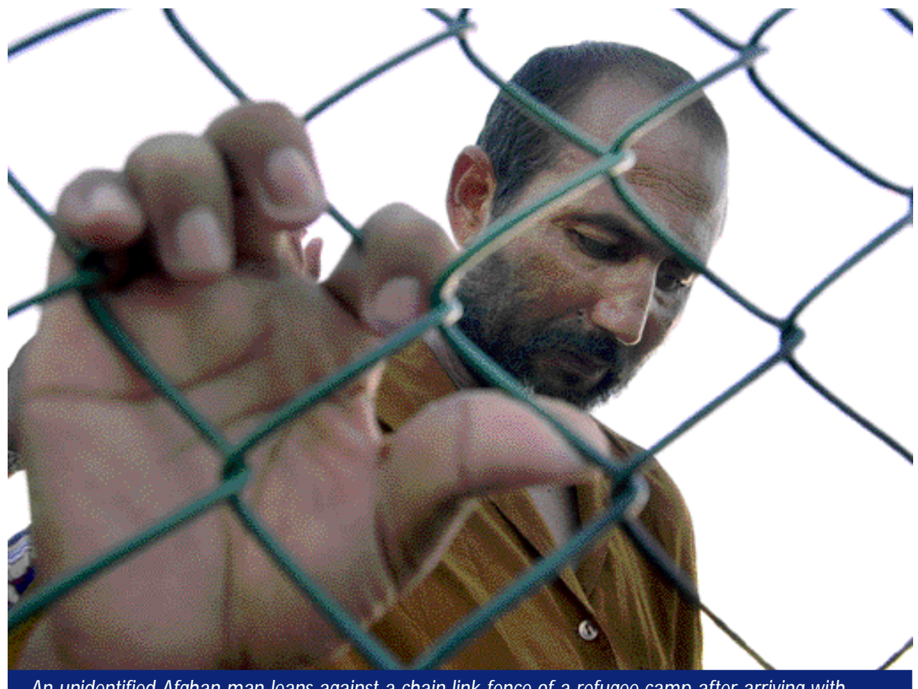
An unidentified Afghan man leans against a chain link fence of a refugee camp after arriving with other asylum seekers on the Island of Nauru, Sept. 19, 2001.