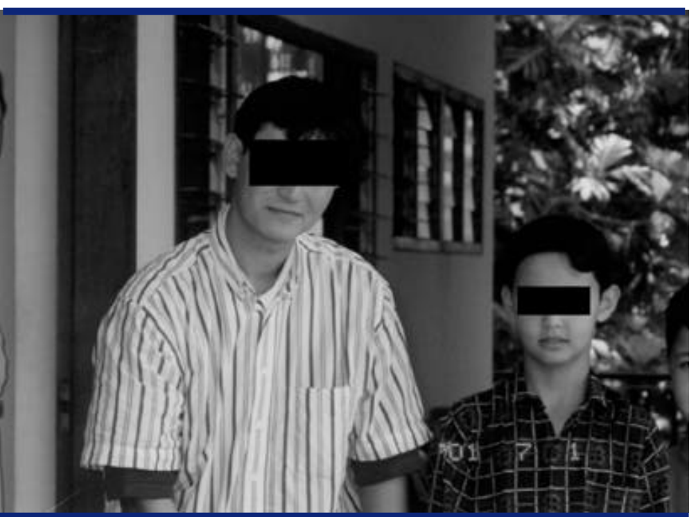
This young ethnic Hazara man from Afghanistan waits with about 65 other Afghans at a hotel in Tretes, East Java, for UNHCR to interview them. "The process takes so long," he told Refugee Reports, "but if UNHCR approves us as refugees, we'll wait. We'll go to any country that accepts us and where there is peace."

Thus, as one observer noted, a "tug of war" has developed in Jakarta. While the United States may agree with Australia's goal of discouraging unauthorized migration, the U.S. inclination not to "reward" such migrants found to be refugees with resettlement has annoyed the Australian government, which fears that asylum seekers left in Indonesia will eventually find their way to Australia. "More importantly," said an Australian official, "it undermines the signal that those with protection needs will be provided for but that they won't get the migration